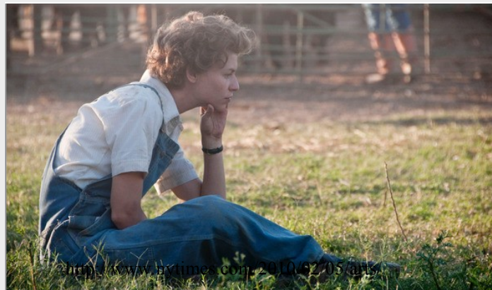
Peering Into A Mind That is More Not Less

“In her autobiography, “Thinking in Pictures: My Life With Autism,” Temple Grandin explains that she values “positive, measurable results more than emotion.” The HBO movie “Temple Grandin” honors its heroine’s priorities, stressing deeds over tearful setbacks and joyous breakthroughs.” -NY Times